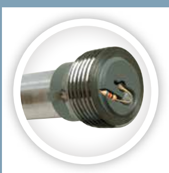
Patented R-Tech Anode Rods prolong the life of the water heater