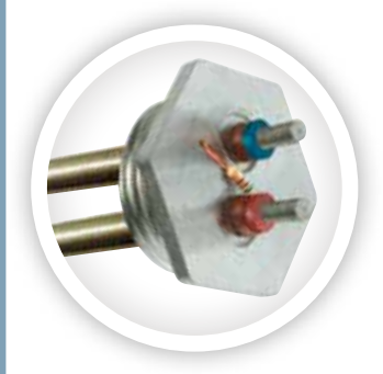
Patented Lifeguard Elements are durable for high performance